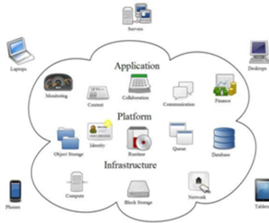
Figure 1. Cloud Computing Architecture