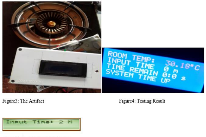
Figure 5: Input time during Testing

The Figure 3 shows how the artifact was assembled, figure 4 shows the test result on the LCD indicating room temperature in degree Celsius, input time in minutes, time remaining in seconds and system time up also indicating. Figure 5 shows the input time during the testing period of the artifact.