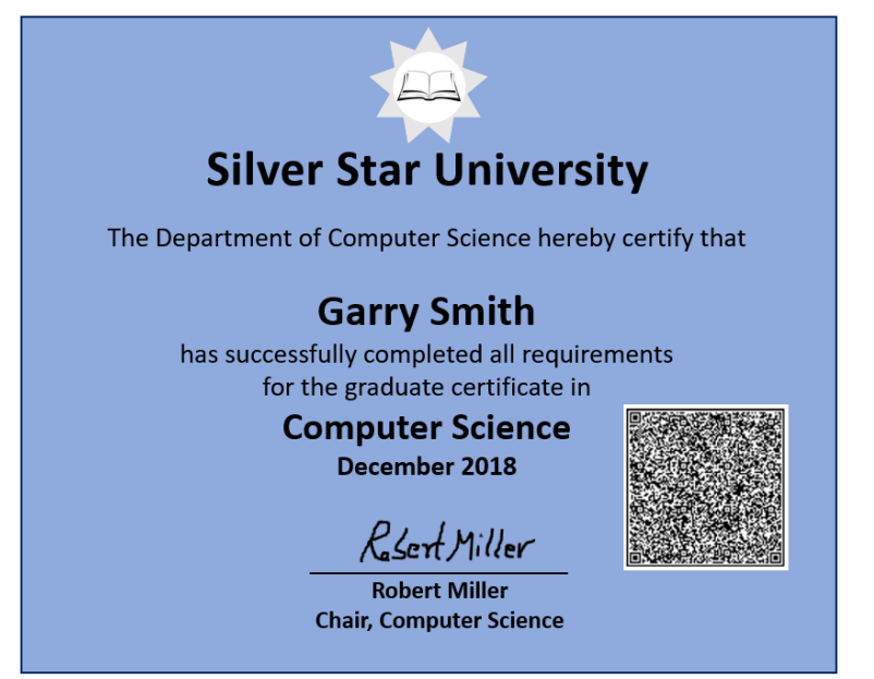
Fig.3 An example forged Degree Certificate with QR code

When a forger or fabricator alters or completely replaces the content in a genuine certificate with QR code, he has two options, either leaving the QR code as is or replacing the actual QR code with his own QR code encoding the altered or replacing information encrypted with his own private key. Fig.3 below shows a forged certificate leaving the QR code as is.