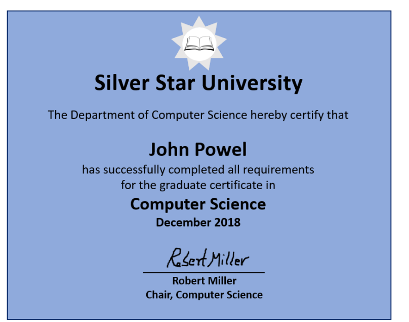
Fig.1 An example Degree Certificate issued by a University

Fig. 1 below shows an example certificate issued to a student by a university without a QR code as per the current practice in the education sector. Such a certificate provides no technical means to verify its authenticity and detect forgery or fabrication.